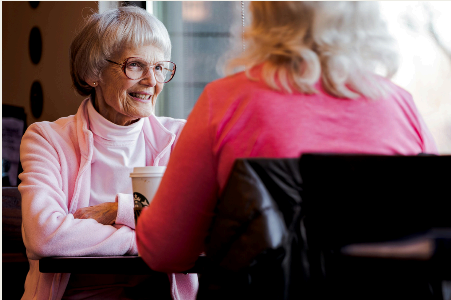
Appointing an Agent