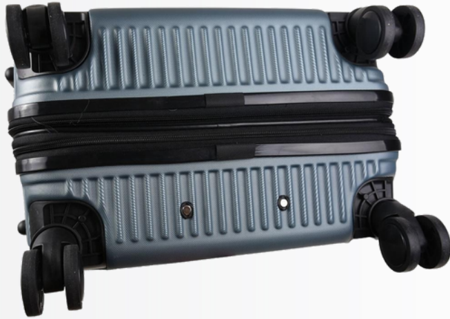
Maleta con expansión