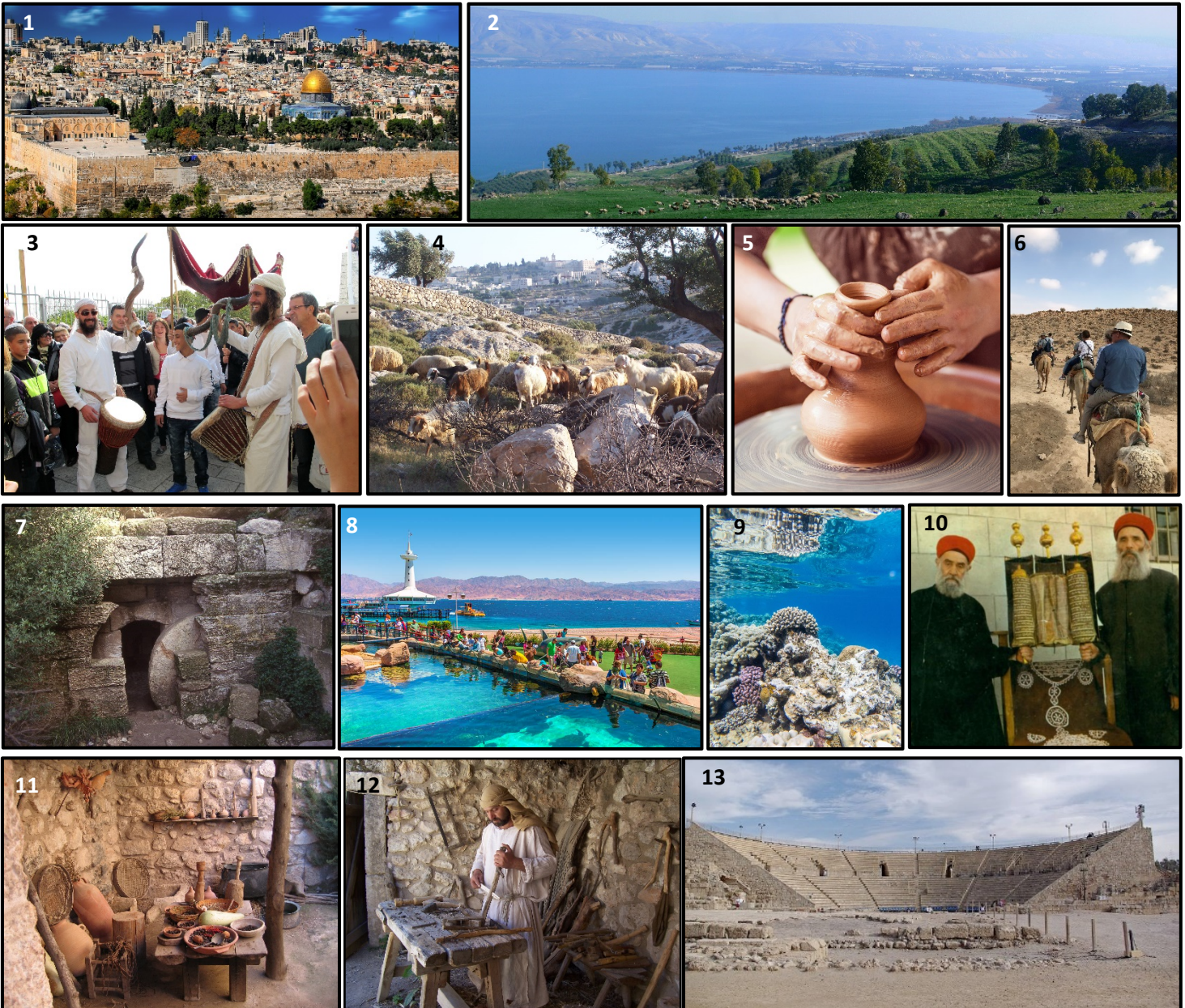
(1) Jerusalem Panorama; (2) Southern end of the Sea of Galilee looking to East; (3) Bar Mitzva celebrated at Dung Gate, Jerusalem; (4) Shepherds' Field outside Bethlehem; (5) Hebron Potter's shop; (6) Intensive Explorations' Camel Trek Be'erotayim, Negev-Sinai border; (7) First Century Rolling Stone Tomb, Midras, Shephelah; (8) Red Sea Underwater Marine Observatory, Eilat; (9) Snorkeling the Red Sea Corals; (10) Samaritan Priests with Oldest Torah Scroll, Mt. Gerazim, Samaria, West Bank; (11) & (12) Nazareth Village, Nazareth; (13) Roman Theater, Caesarea Maritina.