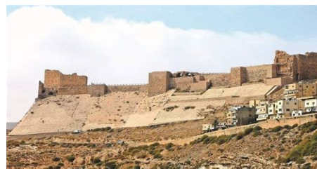
Karak Castle, Jordan

After breakfast, we depart Wadi Rumm heading north past Shobek Castle to visit al-Karak Castle , one of the largest crusader castles in the Levant . Going west from Karak we move once again into the Dead Sea Valley where we visit areas close to Sodom and Gomorrah , another winter hot-springs palace of Herod the Great , and cross significant canyons that feed the waters of the Dead Sea. Eventually, we drive past the Dead Sea to the confluence of the Jordan River where the children of Israel crossed with Joshua and Elijah with Elisha crossed before Elijah's ascension to Heaven . This crossing is called today Al Mughtas and was known in Jesus' day as "Bethbara" or "Bethany beyond Jordan" where Jesus would be baptized by John. Our final Journey this day is back in the eastern mountains to Amman, capitol of the Hashemite Kingdom of Jordan for dinner and overnight at the Grand Palace Hotel where USA Presidents have stayed. (B, D)