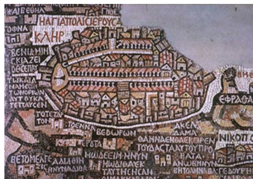
Byzantine Mosaic Map of Holy Land St. George Church, Madaba, Jordan

This morning, after time to enjoy the Dead Sea, we travel by our motor coach up the Pisgah mountains to Mount Nebo , where Moses made his last stopping place before departing the tribes of Israel and entrusting their leadership to Joshua. After taking in the panorama of modern Israel and the Palestinian Territories and reviewing the events on this mountain we head south, stopping in route to tour a mosaic factory before having lunch and visiting the Church of St. George in Madaba . Here is found the oldest mosaic map in the world of the Holy Land displayed on the floor of this Byzantine church. After our visit, we journey southeast along the King's Highway through the biblical lands of Moab and Edom (tribal inheritances of Rueben). Time permitting, we stop to view the ruins of Herod Antipas' fortress-palace overlooking