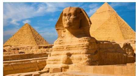
Sphinx and Great Pyramids of Giza, Egypt

After breakfast our first visit is to Memphis (capital of the Pyramid Age) and Saqqara (Djoser's famous step pyramid); we'll then transfer to Giza . We begin with the world-famous Pyramids of Giza , classified among the Seven Wonders of the Ancient World . Here we'll stand in awe of their size and magnificent engineering. Then we will come face to face with the 5,000-year-old Sphinx . Some may choose to ride a camel to the Sphinx. We will explore the 30,000 treasures of Egyptian antiquity , including the famous King Tutankhamen ("King Tut") exhibits at the new Grand Egyptian Museum in Giza . Here also we visit the Solar Boat Museum to see the funerary barge used 4500 years ago by Pharaoh Khufu (also known as Cheops, the second pharaoh of the Fourth Dynasty of the Old Kingdom of Egypt), Our visit to the GEM will help us learn the history and see life as it existed at the time of the pharaonic dynasties. As time permits, we will include visits to a carpet factory, the Papyri Institute, and some may choose an optional evening light and sound show at Giza. A short distance away is our hotel near the Pyramids and the GEM . (B, D)