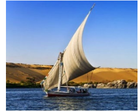
Felucca (Nile sailboat) ride to the Nubian Village of Hessa

After breakfast we will transfer to Cairo Airport for our flight to Aswan City . After checking in to our Nile Cruise Ship , we will have lunch onboard and then visit the Philae Temple , the Aswan High Dam , and the Unfinished Obelisk . In the late afternoon, we will sail on a Felucca (Nile sailboat) to the Nubian Village of Hessa . Our dinner and overnight will be back onboard our cruise ship. Evenings and prior to shore excursions some lectures on ancient Egyptian cultures and temple ceremonies will occur throughout the cruise. (B, L, D)