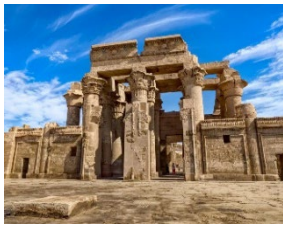
Dual Temple of Kom Ombo,

Today we will first visit the Graeco-Roman Temple at Kom Ombo . The temple at Kom Ombo is about 30 miles north of Aswan and was built during the Graeco-Roman period (332 BC-AD 395). The temple is unique because it is a double temple, dedicated to Sobek the crocodile god , and Horus the falcon-headed god . The layout combines two temples in one with each side having its own gateways and chapels. Here we will also learn some of the early Egyptian temple ceremonies and translate some of the significant hieroglyphic symbols associated with those ceremonies. After lunch, we continue down the Nile River (north) to Edfu and its magnificent temple. Dinner and shipboard entertainment will highlight our evening. (B, L, D)