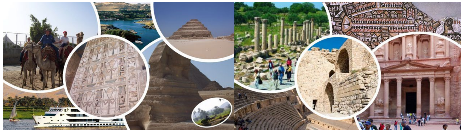
Scenes of Egypt & Jordan

Those who choose the 7-day Post-Egypt Jordan Option will rise in the early morning and after breakfast, transfer to the Cairo International Airport for a flight to the Hashemite Kingdom of Jordan . Those who are going on to other destinations will also transfer to the Cairo International Airport for their departures. Upon arrival at the Queen Alia International Airport near the capitol of Jordan, Amman , the Post-Egypt Jordan Explorations Tour participants will transfer to the Mövenpick Resort and Spa at the Dead Sea for a relaxing day at the private beaches and swimming pools. The Jordan tour will be link up with additional participants coming from other locations who chose to join this eight-day Jordan tour. Please see the separate detailed brochure for the Eight-day Post-Egypt Jordan Exploration Tour to get details, prices, and the daily itinerary. (B, D)