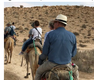
Camel Trek & Camping

The most popular method is on foot, which allows for a scenic and memorable experience and is not a difficult walk. After visiting the ruins of Petra and the Petra Museum followed by a quick lunch, we will head south to Wadi Rumm , where the events of Lawrence of Arabia took place. Stopping briefly at the Wadi Rumm Visitors Center , we continue across the desert to our Bedouin camp . Here we have an hour-long camel trek , followed by the traditional Sarb (a traditional Bedouin style of cooking where marinated meat and vegetables are buried in an oven dug in sandy ground) dinner accompanied by a lecture from a local Bedouin about their lifestyles and family structure. Following dinner, we see the magnificent night sky and learn about local star-gazing legends before retiring to our camping facilities. (B, D)