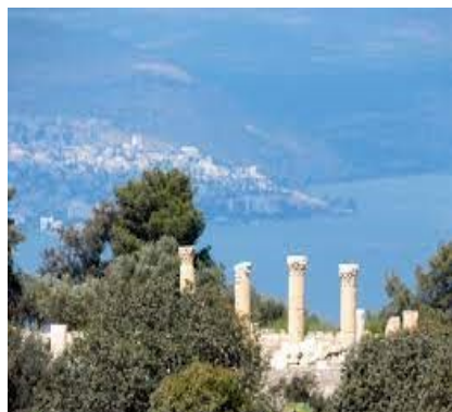
Sea of Galilee from Umm Qais (Gadara, Jordan)