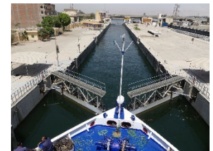
Esna Lock on the Nile

Our first visit this morning is to the Temple of Horus in Edfu , the second largest temple in Egypt . The Egyptian god Horus was also portrayed as the falcon-headed god. Returning to our ship, we have lunch as we continue down the Nile passing through the Esna Lock . Passing through the Esna Lock is a thrilling experience for Nile cruise passengers. The lock is an engineering marvel, and watching the gates open and close is a sight to behold. At this point we are about 485 miles south of Cairo. We will participate with the many rowboat merchants that toss their wares from their boats to the passengers on our cruise vessel as we sail. We will continue to sail down the Nile through the Esna lock and on to Luxor . (B, L, D)