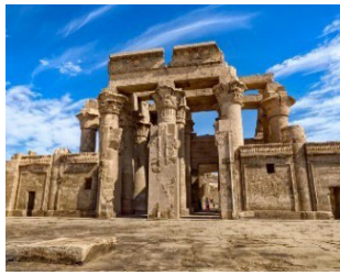
Dual Temple of Kom Ombo, Egypt

Today we will first visit the Graeco-Roman Temple at Kom Ombo . The temple at Kom Ombo is about 30 miles north of Aswan and was built during the Graeco-Roman period (332 BC-AD 395). The temple is unique because it is a double temple, dedicated to Sobek the crocodile god , and Horus the falcon-headed god . The layout combines two temples in one with each side having its own gateways and chapels. Here we will also learn some of the early Egyptian temple ceremonies and translate some of the significant hieroglyphic symbols associated with those ceremonies. After lunch, we continue down the Nile River (north) to Edfu and its magnificent temple. Dinner and shipboard entertainment will highlight our evening. (B, L, D)