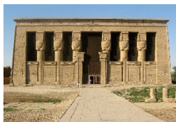
Temple of Dandara

Our stay in upper Egypt is completed with a visit to the Temple of Dendera , where worship of the gods of Egypt is found as early as 3,000 B.C. The Temple of Dendera was one of the last completed temples and has the son of Julius Caesar and Cleopatra VII (famous Cleopatra of Shakespeare) and Pompeii carved on wall reliefs. It is considered one of the best preserved and beautiful temples of Egyptian antiquity. Here we will review the ancient temple ceremonies before returning to Luxor for some shopping and our return flight to Cairo . We will return to the Steigenberger Pyramids Hotel, Giza for dinner and overnight. (B, D)