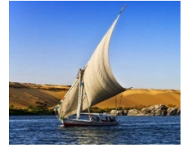
Felucca (Nile sailboat) ride to the Nubian Village of Hessa

After breakfast we will transfer to Cairo Airport for our flight to Aswan City . After checking in to our Nile Cruise Ship , we will have lunch onboard and then visit the Philae Temple , the Aswan High Dam , and the Unfinished Obelisk . In the late afternoon, we will sail on a Felucca (Nile sailboat) to the Nubian Village of Hessa . Our dinner and overnight will be back onboard our cruise ship. Evenings and prior to shore excursions some lectures on ancient Egyptian cultures and temple ceremonies will occur throughout the cruise. (B, L, D)