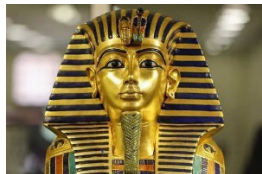
The Golden Funerary Mask of King Tutankhamun

The Grand Egyptian Museum (GEM) is the finest and most extensive collection of ancient Egyptian civilization in the world. We will explore the over 30,000 treasures of Egyptian antiquity , including the famous King Tutankhamen (“King Tut”) exhibits housing over 5,398 pieces from King Tut’s Tomb. Here also we visit the Solar Boat Museum to see the funerary barge used 4500 years ago by Pharaoh Khufu (also known as Cheops, the second pharaoh of the Fourth Dynasty of the Old Kingdom of Egypt), Our visit to the GEM will help us review the history and see life as it existed at the time of the pharaonic dynasties. After dinner at the Steigenberger Pyramids Hotel, Giza , we spend our last night in Egypt having explored the wonders of this ancient land of the scriptures. (B, D)