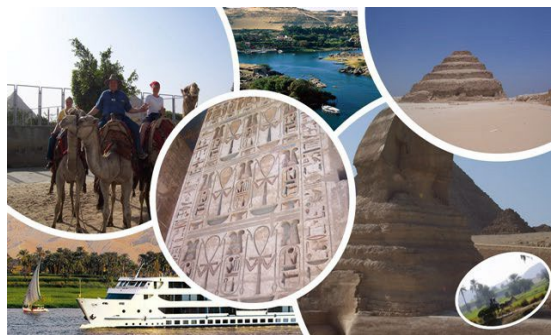
Scenes of Egypt

Days 11-12 (Wednesday, April 27-28) Departure Days Late night or early morning departures, transfer to the Cairo International Airport for flights to their chosen destinations.