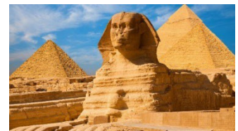
Sphinx & Great Pyramids of Giza, Egypt

After breakfast our first visit is to Memphis (capital of the Pyramid Age) and Saqqara (Djoser's famous step pyramid); we'll then transfer to Giza . We begin with the world-famous Pyramids of Giza , classified among the Seven Wonders of the Ancient World . Here we'll stand in awe of their size and magnificent engineering. Then we will come face to face with the 5,000-year-old Sphinx . Some may choose to ride a camel with the Great Pyramids and Sphinx as a background. As time permits, we will include visits to a carpet factory, the Papyri Institute, and some may choose an optional evening light and sound show at Giza. A short distance away is our hotel near the Pyramids and the GEM (B, D)