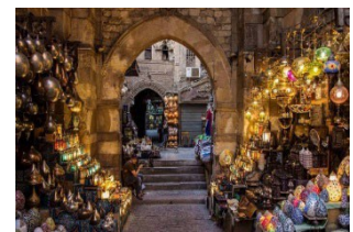
Khan Khalili Bazaar, Cairo

After breakfast, our first stop today is the famous Cairo Egyptian Museum . Here discoveries from the tombs and cities throughout Egypt are exhibited. The treasures of Tanis that rival the "King Tut" collections, the Narmer Pallet (earliest unification of Upper and Lower Egypt about 5,000 years ago), as well as many other interesting exhibits from the various periods of ancient Egyptian history are on display. After lunch we will transfer to the National Museum of Egyptian Civilization (NMEC) in Old Cairo which is a sweeping, multi-civilization complex exploring Egyptian heritage from prehistoric times to the modern era. It is world-