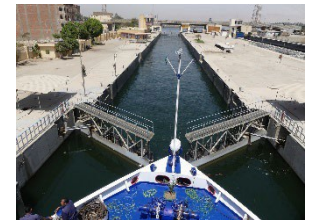
Esna Lock on the Nile

Our first visit this morning is to the Temple of Horus in Edfu , the second largest temple in Egypt . The Egyptian god Horus was also portrayed as the falcon-headed god. Returning to our ship, we have lunch as we continue down the Nile passing through the Esna Lock . Passing through the Esna Lock is a thrilling experience for Nile cruise passengers. The lock is an engineering marvel, and watching the gates open and close is a sight to behold. At this point we are about 485 miles south of Cairo. We will participate with the many rowboat merchants that toss their wares from their boats to the passengers on our cruise vessel as we sail. We will continue to sail down the Nile through the Esna lock and on to Luxor . (B, L, D)