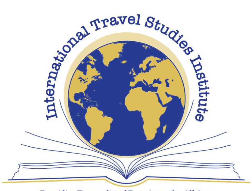
Providing Transcultural Experiences for All Ages