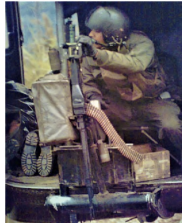
Once we dropped in the troops and the battle had begun, it was time for us to return with supplies and to take the body bags back to be shipped home.