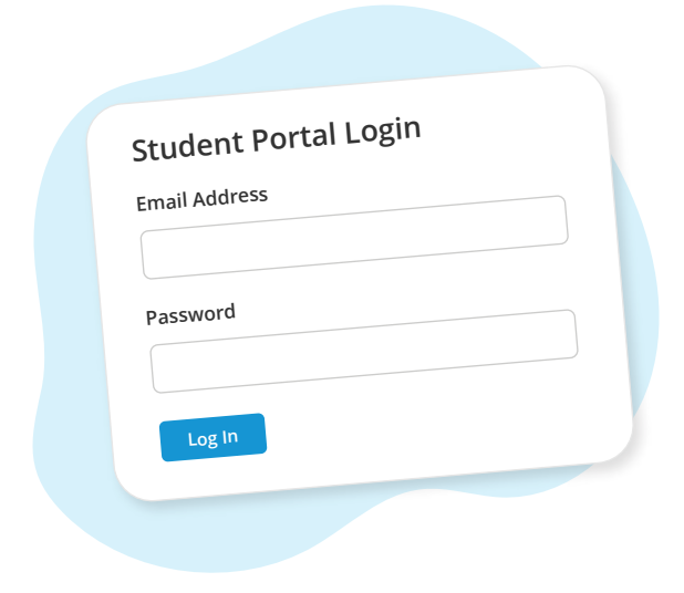
Sign in to the Student Portal on your phone