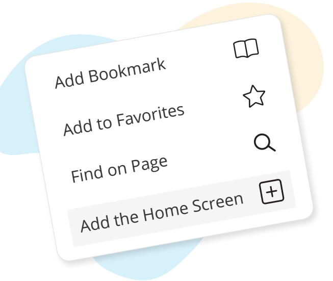
Scroll down and tap "Add to Home Screen"