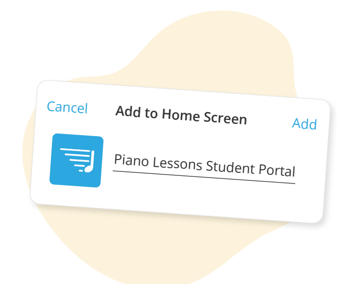
Name the shortcut, then tap "Add"