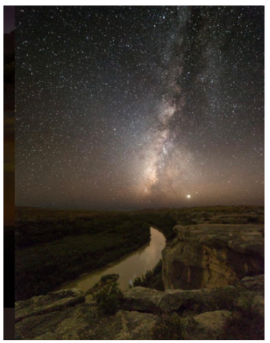
Rio Grande Points the Way to the Milky Way