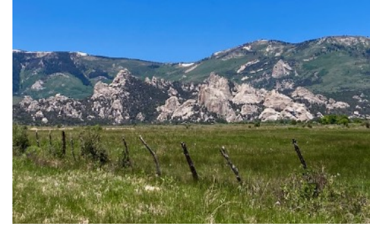
Castle Rock State Park

What a special place I had found in a far-off section of Idaho!