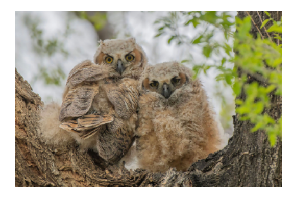
Great Horned Owlets by Buddy Green, Honorable Mention 2023

The next Free National Park Day will be August 4, 2024, in honor of the anniversary of the Great American Outdoors Act. The Great American Outdoors Act (GAOA), passed in 2020, provides funding to improve infrastructure and expand recreation opportunities in national parks and other public lands. The legislation established the National Parks and Public Land Legacy Restoration Fund and guaranteed permanent funding for the existing Land and Water Conservation Fund. (Information and photo courtesy NPS.)