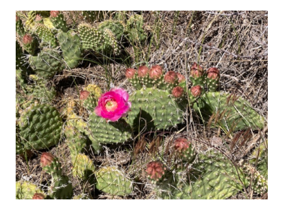
Scenes along Castle Rock State Park hikes.