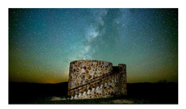
Night Sky photo near Skyline Drive, Davis Mountain State Park

Additionally, the park is known for its night sky photography. To stay in the park after ten o'clock in the evening, visitors must pay the $6 day pass fee, plus an additional $3 for a late night pass. Passes are available at the park headquarters as you enter. If you have a Texas State Park pass, the day pass fee is free but the additional $3 late night pass is additional. (For those expecting to enter a Texas state park more than seven times during the year, the $70 Texas State Park pass will save you money.)