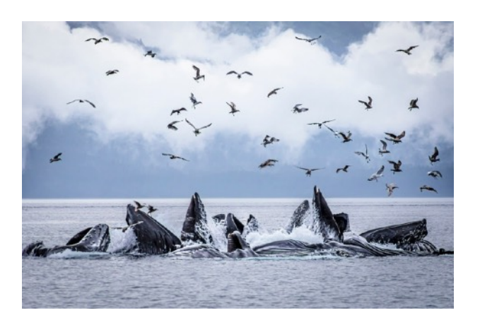
Humpback Whales Bubble Net Feeding by Frank Zurey

The Colorado Photographic Arts Center (CPAC) has chosen RMOWP member Frank Zurey's photo of humpback whales bubble net feeding for the CPAC 61st Annual Member's Show. Frank's image is also being used for all pre-show advertising.