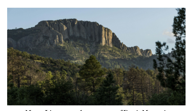
Mount Livermore

Continuing north on Highway 118, about four miles from the trailhead, you turn southwest on to Highway 166, heading back towards Fort Davis. The road continues through mountain passes, turning into grasslands and the Chihuahua Desert, past Bear Mountain and the west side of Mount Livermore, the tallest mountain in the Davis Mountain chain.