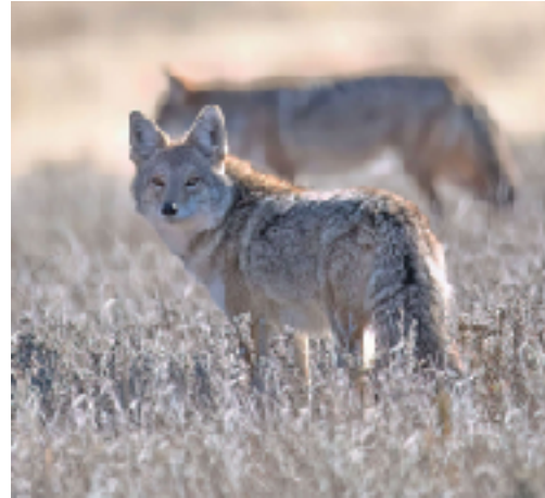
1st Images from Last Conference, Buddy Green, Coyote at Valles Calderas National Preserve