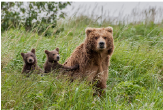
Grizzly Mom with Her Cubs