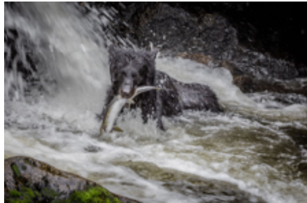
1st Place Fauna, Frank Zurey, Black Bear Got a Salmon