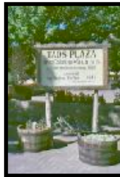
Text & photo by Don Laine