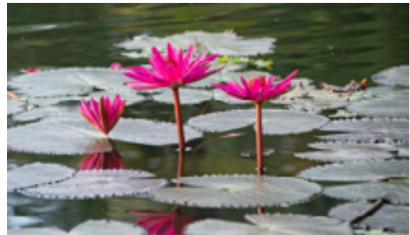
1st Flora, Beto Gutierrez, Red Water Lily