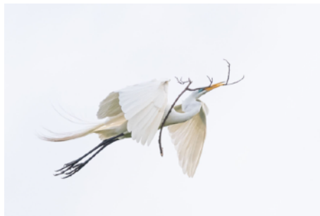
1st Place Fauna