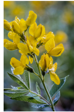
1st Place Flora ©Frank Zurey