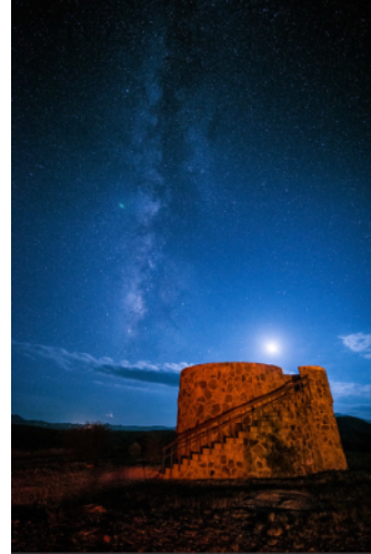
Davis Mountains and Milky Way