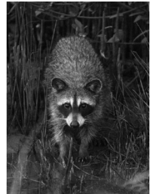
1st Place B&amp;W