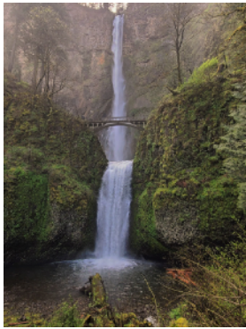
1st Place Scenics