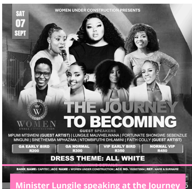
Minister Lungile speaking at the Journey of Becoming event on 07/09/24