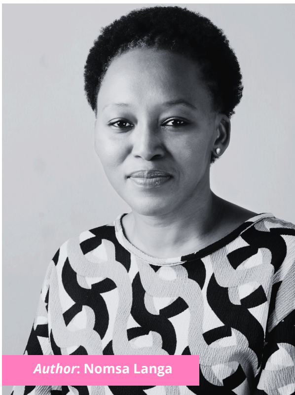
Author: Nomsa Langa

Full blog on the website www.gracedgem.org