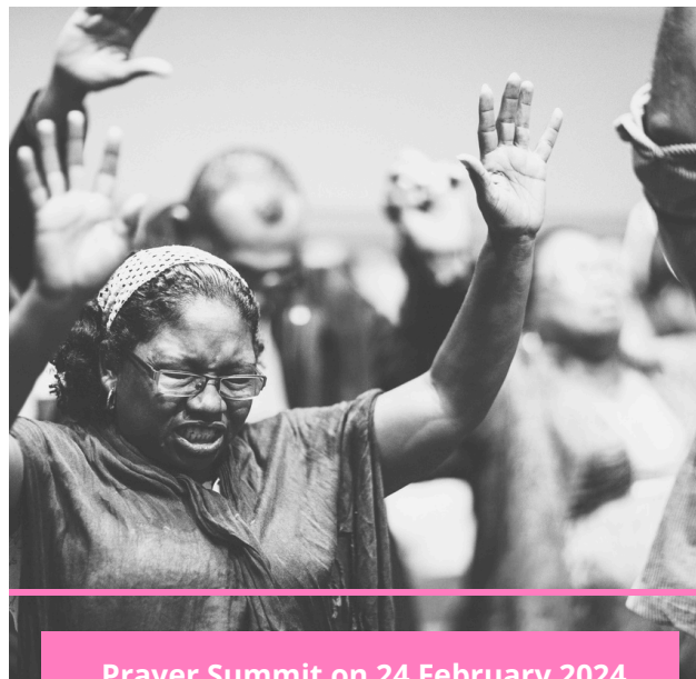
Prayer Summit on 24 February 2024