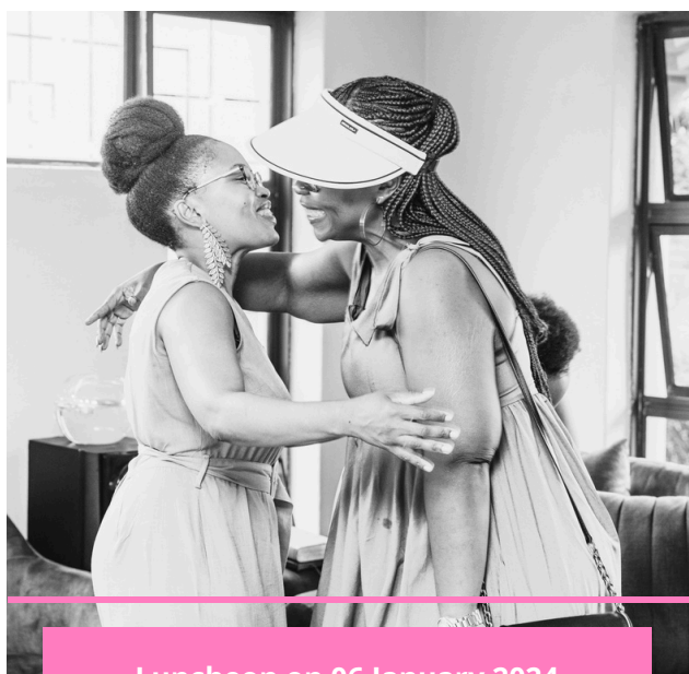
Luncheon on 06 January 2024

We started with a luncheon on the 6th of January 2024. The heart behind the luncheon was to gather God's beloved daughters to build a word-based fellowship that will culminate in deep reflections, edification and become a strong support base for women who are called to ministry. We experienced laughter, sweet tears, and celebrated as we counted our blessings.