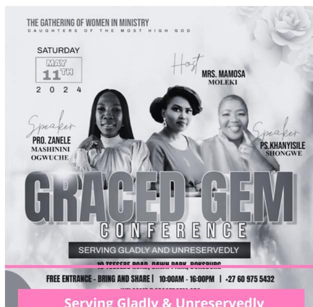
Serving Gladly & Unreservedly Conference on 11 May 2024