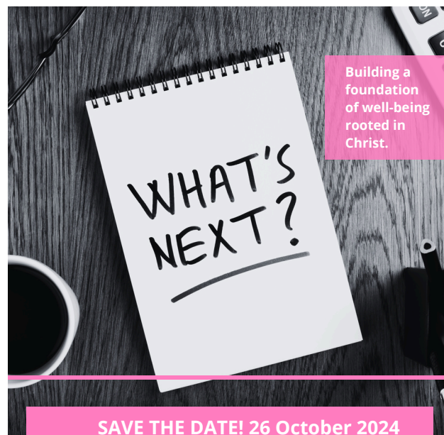
SAVE THE DATE! 26 October 2024 SOUND MIND CONFERENCE