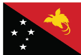
Papua New Guinea