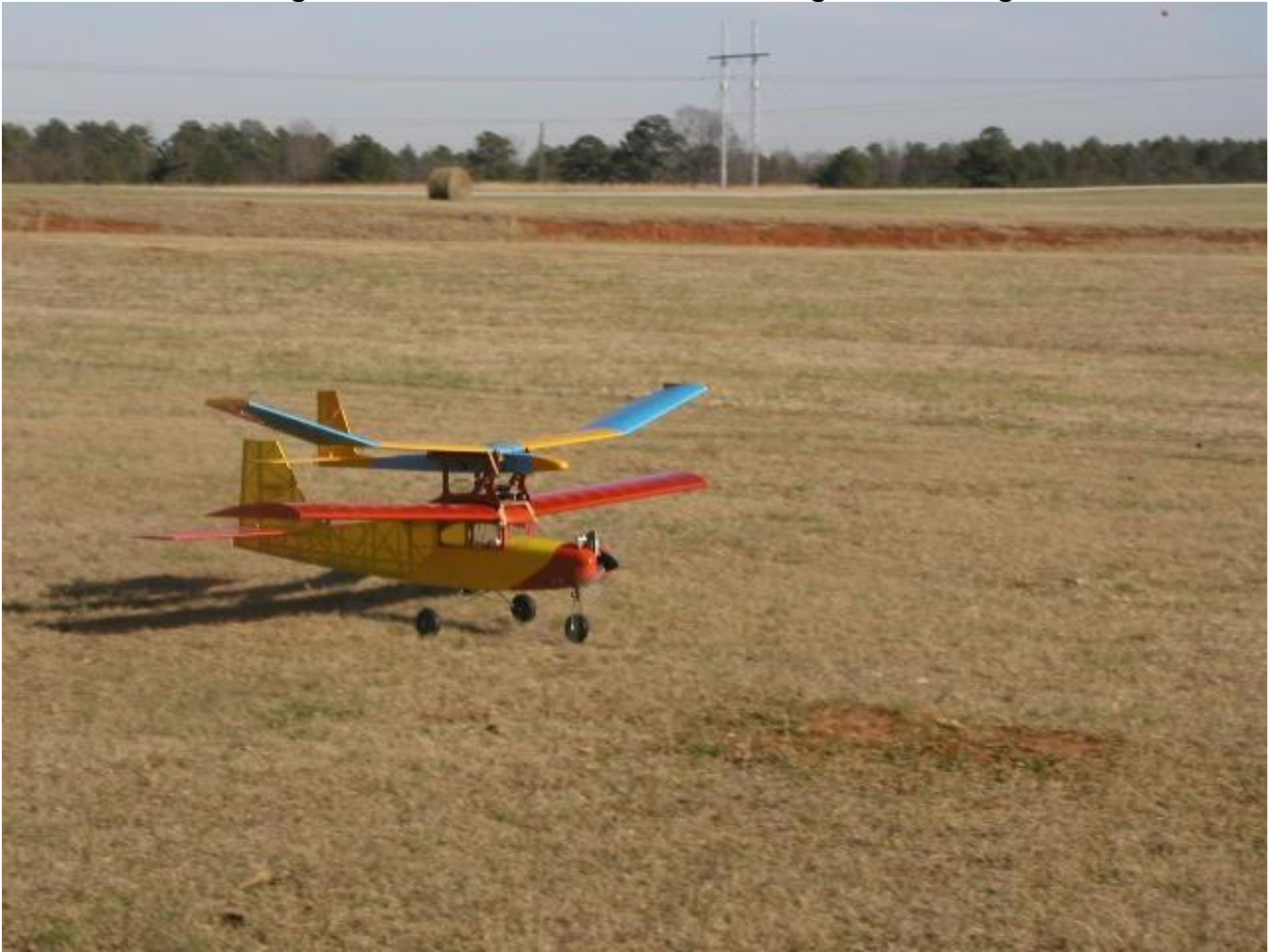
Senior Cadet with glider launch mechanism. Milledgeville Georgia.