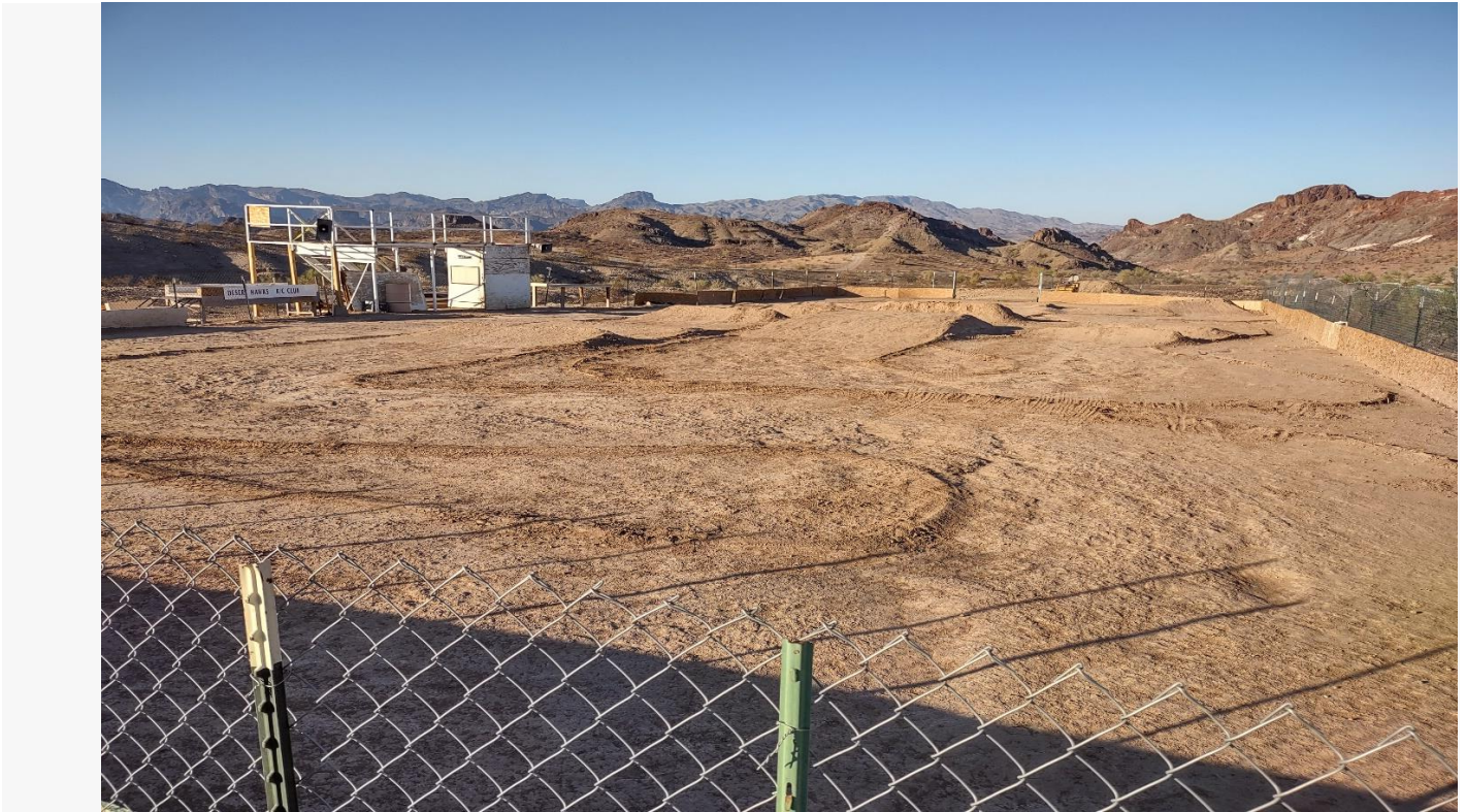
Race Course track getting a makeover