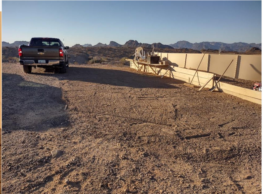
new parking / setup area surface (oval Track)