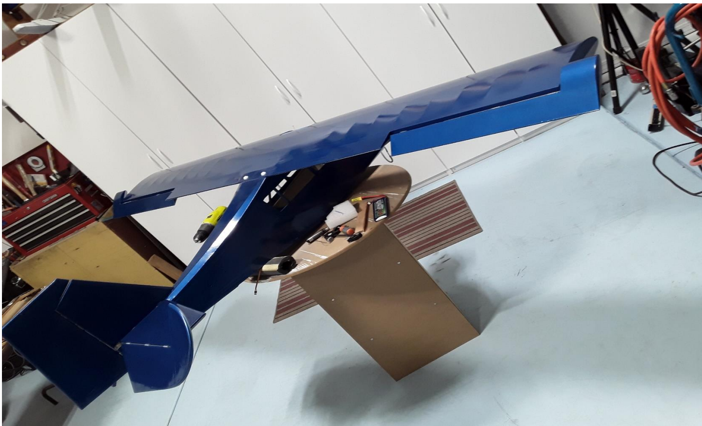
This ones fully assembled and ready for first startup and maybe first flight