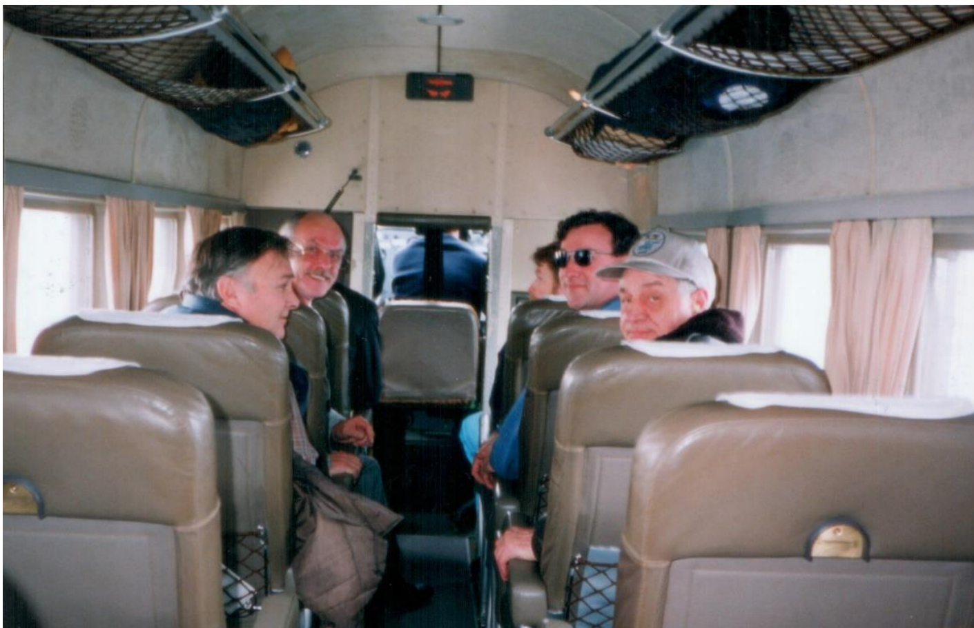
My ground crew getting ready for takeoff in a Junkers JU-52 Tri Motor