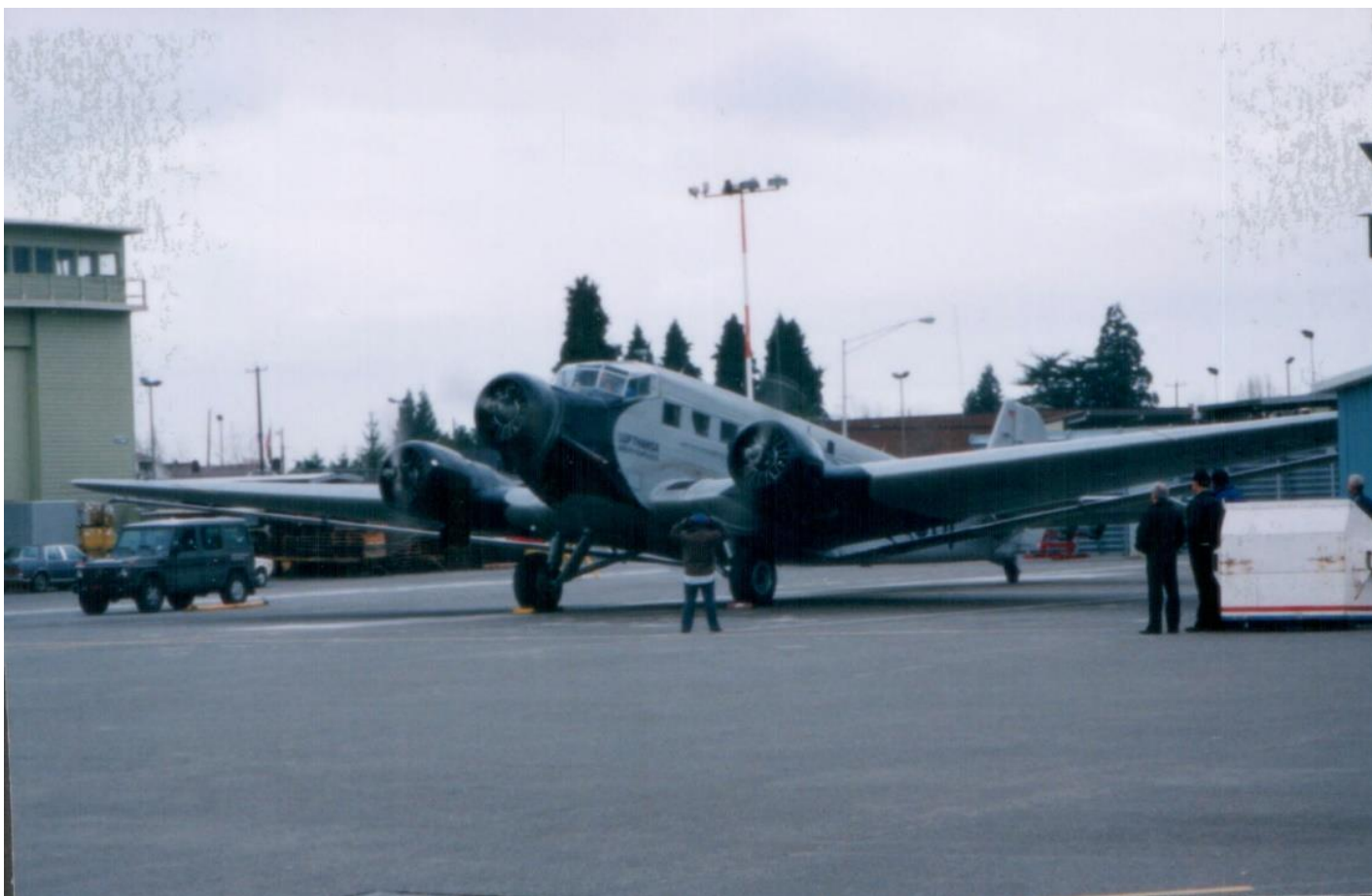
Ready to release for taxi after engine startup 1994 Boeing field Seattle Wa.