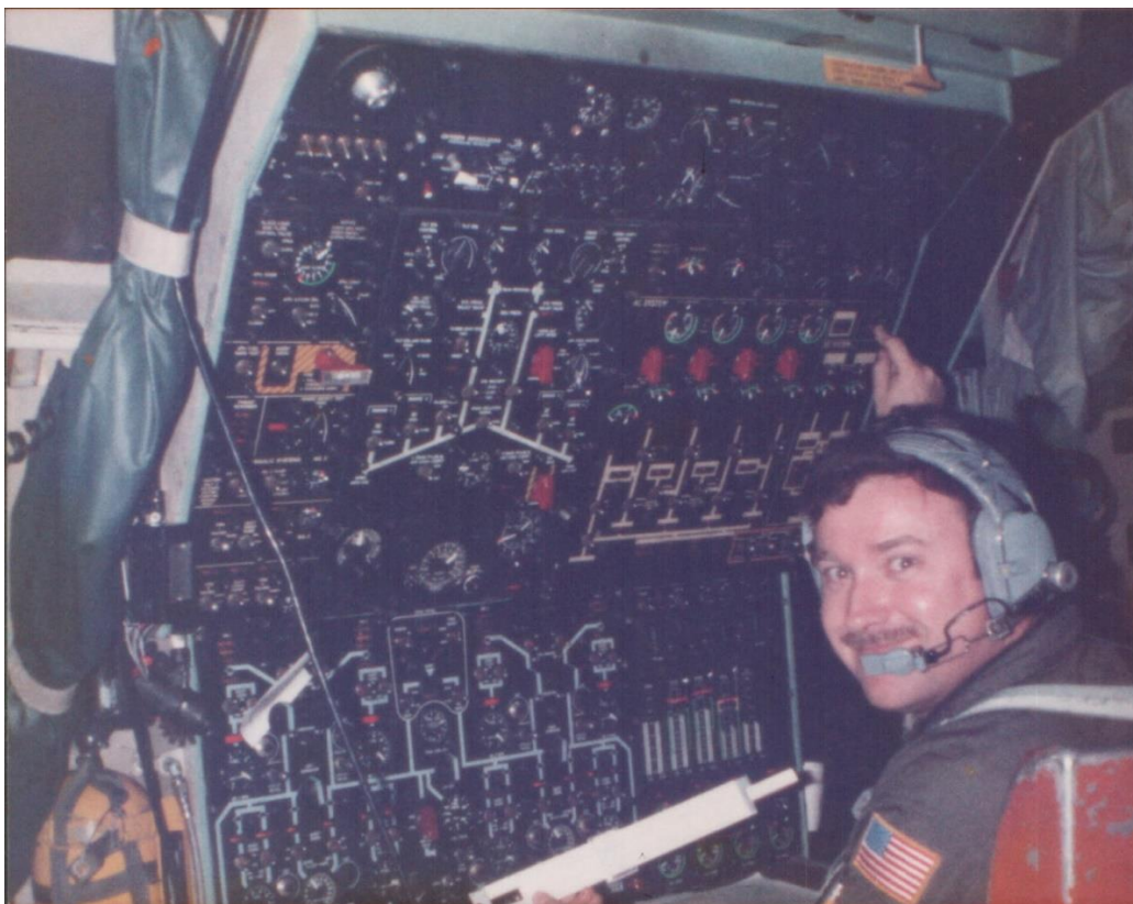
Flight engineer working fuel calculations and ready for Taxi (Decades ago)

This area intentionally left blank Because nobody submitted any articles !