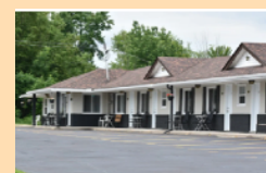
Time Traveller Motel