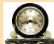
The Canadian Clock Museum