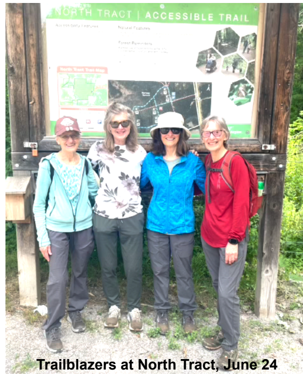
Trailblazers at North Tract, June 24