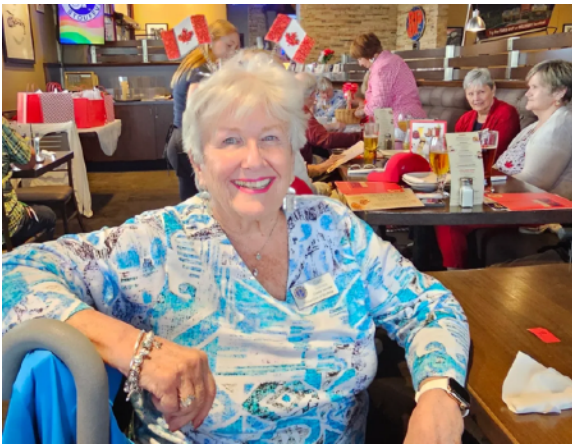
Below & Right: Muskoka Discovery Centre and Muskoka Cruise, June 10