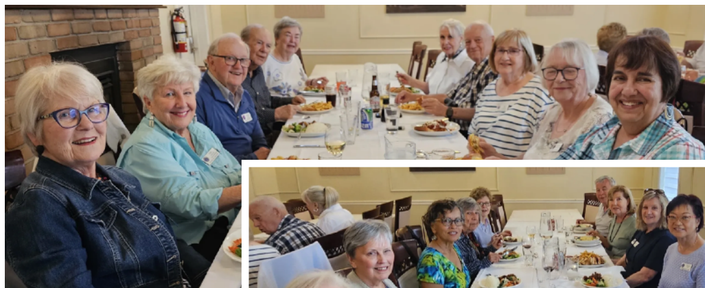
Left & below: Lunch Bunch Lunch at Hanson's, June 23