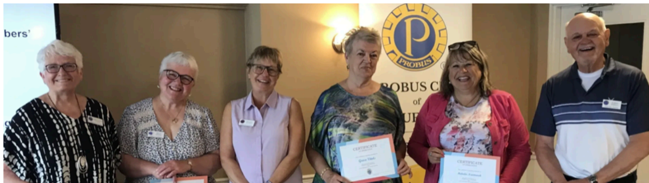
Above: Volunteers receive their Certificate of Appreciation and Gift Bag, June 11

PHOTO GALLERY - with many, many more on the website. Click here to view.