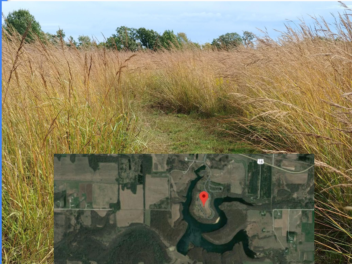
Prairie Maze Trail