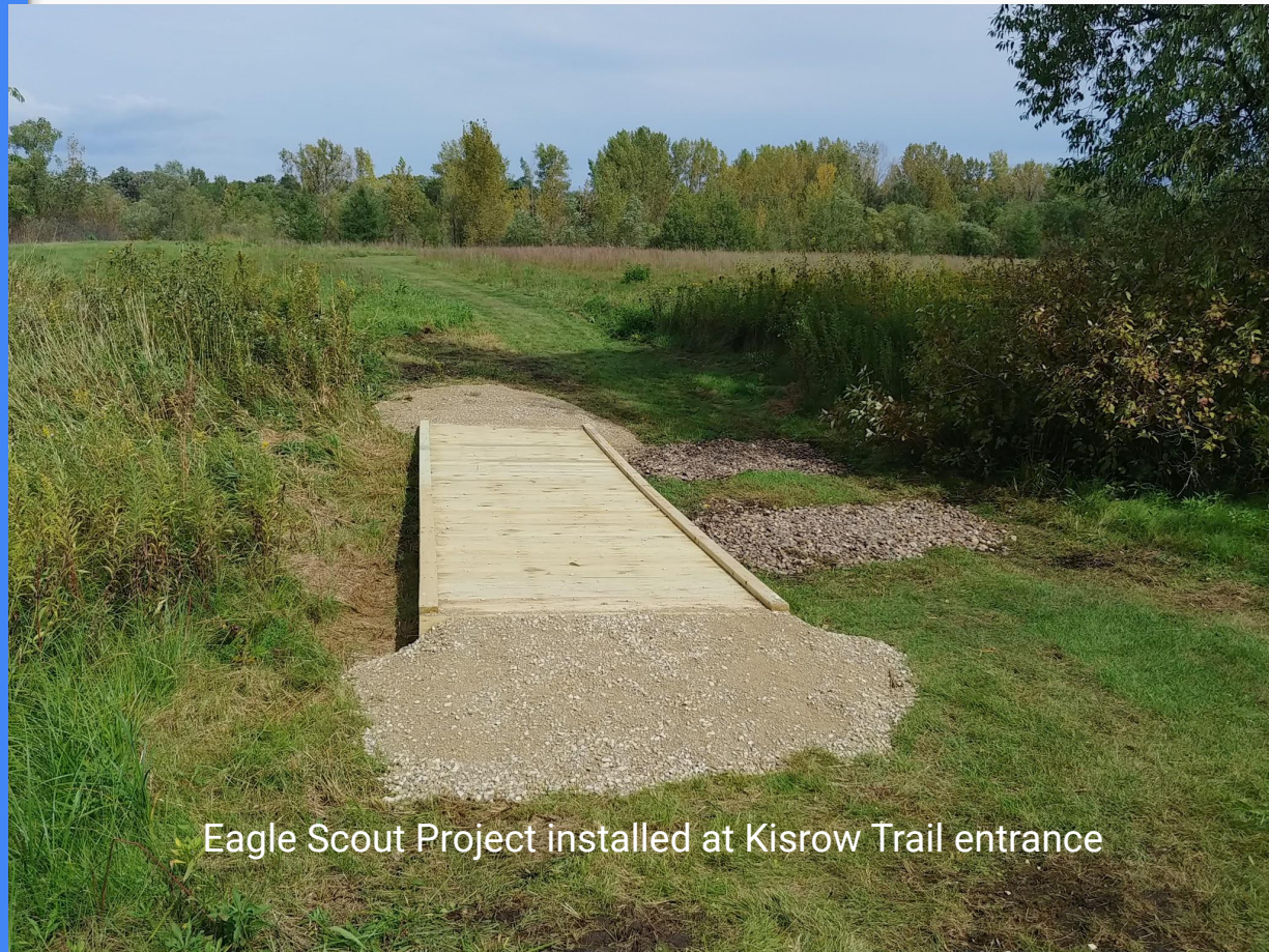
Eagle Scout Project installed at Kisrow Trail entrance