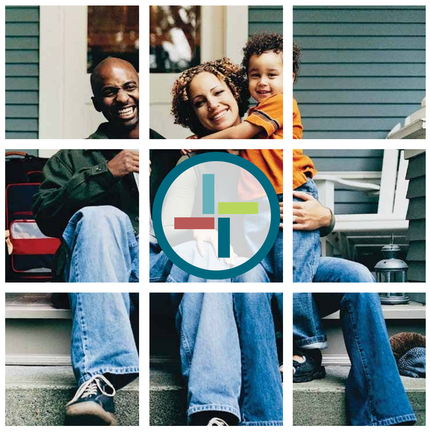
City of Philadelphia Department of Licenses and Inspections Produced by the Commissioner's Office

LICENSES + INSPECTIONS CITY OF PHILADELPHIA