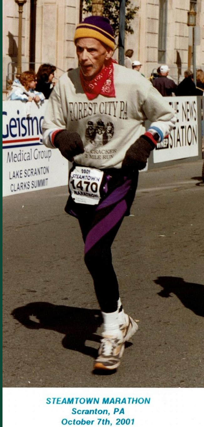
STEAMTOWN MARATHON Scranton, PA October 7th, 2001