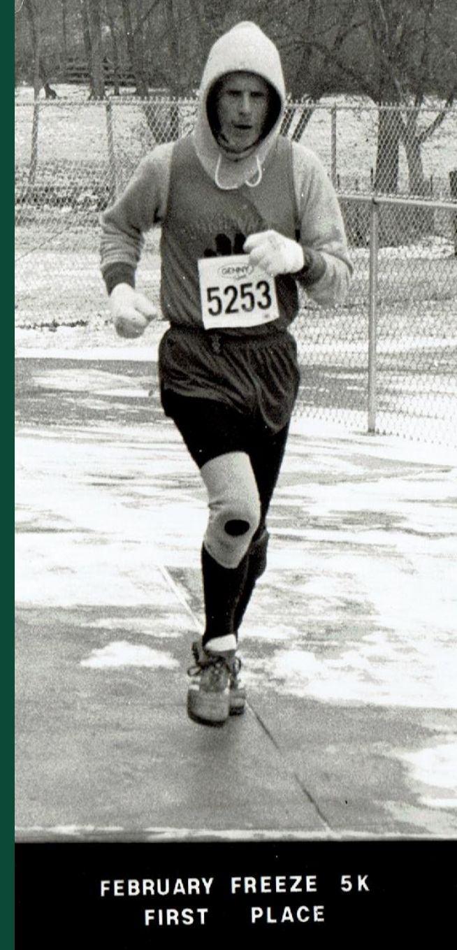
FEBRUARY FREEZE 5K FIRST PLACE

THE 5K WILL START AT THE D&H TRAILHEAD IN FOREST CITY LOCATED ON COMMERCE BOULEVARD. THE ONE-MILE COMMUNITY FUN WALK WILL BEGIN AT APPROXIMATELY 10:45 AM