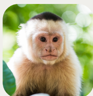
Monkey visits during our workshops