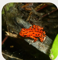
Cute red frogs on your jungle walks to the beach