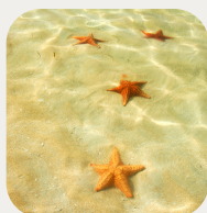
Starfish, rays and beautiful fish during snorkeling