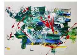
Étude no. 12 Series – I