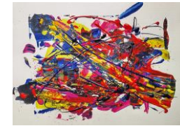
Étude no. 15 Series – I