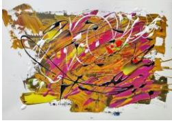
Étude no. 1 Series – I