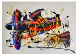
Étude no. 8 Series – I