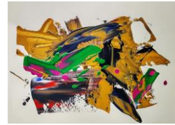
Étude no. 10 Series – I