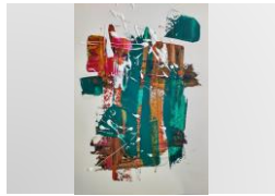
Étude no. 7 Series – I