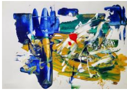
Étude no. 6 Series – I