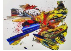
Étude no. 9 Series – I