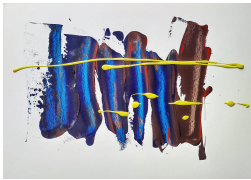
Étude no. 3 Series – I