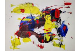
Étude no. 13 Series – I