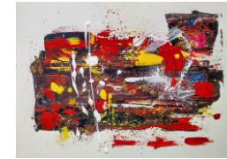
Étude no. 14 Series – I