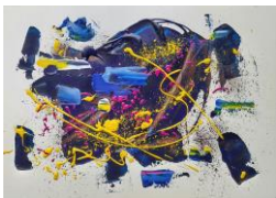
Étude no. 4 Series – I