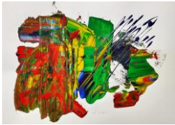
Étude no. 2 Series – I