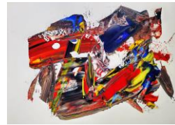
Étude no. 11 Series – I