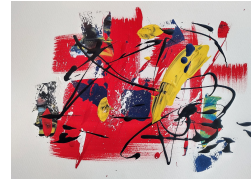
Étude no. 10 Series – II