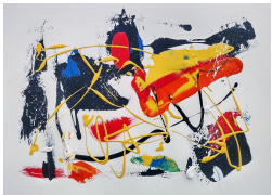
Étude no. 2 Series – II