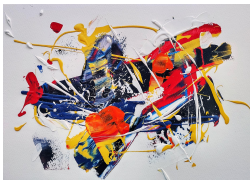
Étude no. 3 Series – II