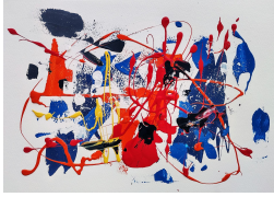
Étude no. 1 Series – II