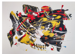
Étude no. 8 Series – II