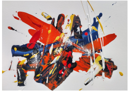
Étude no. 6 Series – II