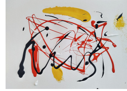
Étude no. 9 Series – II