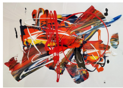
Étude no. 7 Series – II