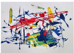
Étude no. 4 Series – II