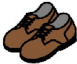
pair of shoes