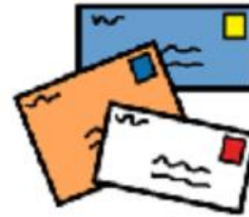
3 pieces of mail