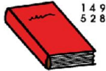
book with a number in it