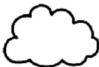
a cloud in the sky