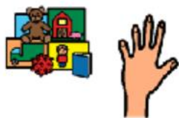
toy smaller than your hand