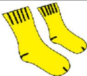
pair of matching socks