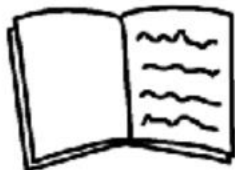
book with the first letter of your name in the title