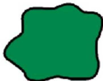
something green that grows