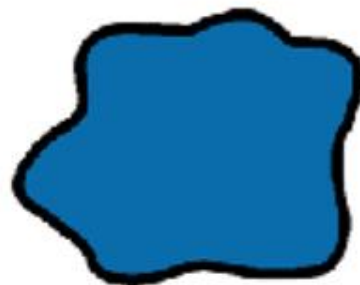
2 blue things