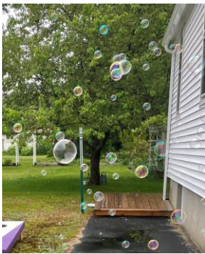
“Before opening, the stage is set for fun on and above ground.”

BBB was a rousing success! Shoppers sipped coffee, browsed books for rock-bottom prices, chose delicious desserts to take home and found colorful perennials for just the right spots in their gardens.