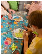
“more frosting anyone?”

There was something for everyone, especially children. In the grassy plaza between the library and arts center, kids dipped bubble wands into a vat of soapy liquid and floated gigantic bubbles up and over the steeple of the old Congregational church that now houses The Arts Center at 8 Hancock. Inside the Arts Center, transformed with modern, comfy furniture, a brother and sister wielded small spatulas to colorfully decorate the goodies inside their cookie packets. (One grandma noted that, on their way home, her grandson proclaimed “that was the best day of my life”. And at only 7 years old!)