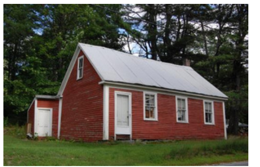
This iconic red Ridlon Schoolhouse must be moved. Plans are to rebuild the original -smaller & white! - at the Ossipee Valley Fairgrounds. Funds needed !

HHS affirmed its priorities were to relocate the schoolhouse where it could be opened to the public, with a preference to keeping it in South Hiram.