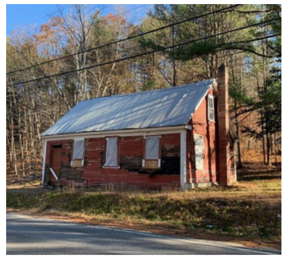
The building looked like this when we closed it in November 2023

Cliff Whitney discovered an added 6-foot extension, making an interior wall the original exterior. See the boarded-up window in center!