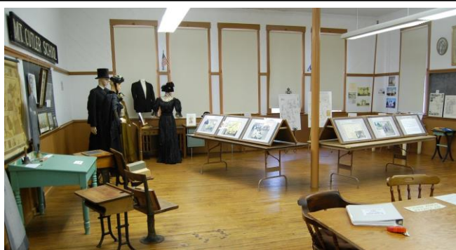
Inside Great Ossipee Museum, formerly Mt. Cutler School, are exhibits on historical schools and recent gifts, such as the Gay 90s clothing on display now.