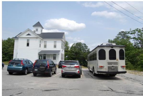
The trolley of Northeast Transportation & Tours at Great Ossipee Museum on Sunday August 1, 2021 for "Hidden Historical Houses of 1820," a Maine State Bicentennial celebration.

The Museum is next open Sat. Aug. 21 from 9:30-12:30. FMI 207-615-4390.