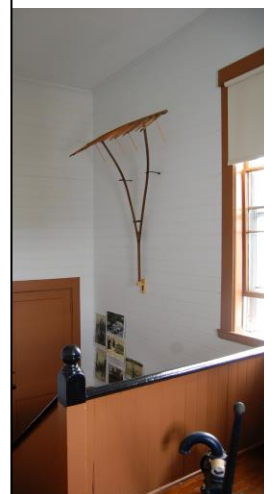
A loafer rake newly installed