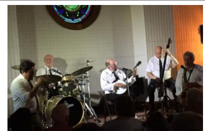
BELLAMY JAZZ BAND