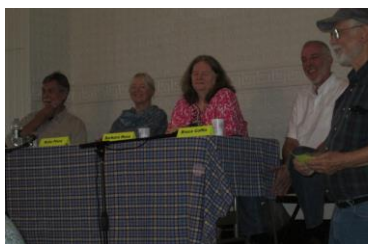
MAINE MYSTERY WRITERS