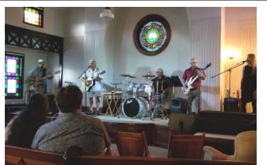
PRIMITIVE MAN CONCERT