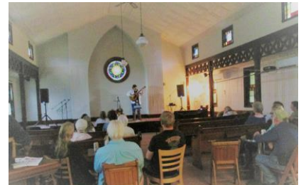
CARLOS ANGELES - CONCERT