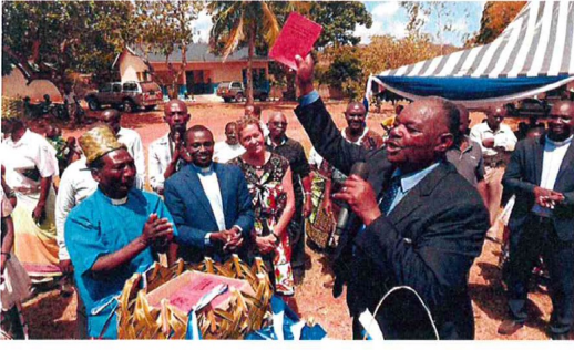
A Scripture dedication in Kenya, East Africa