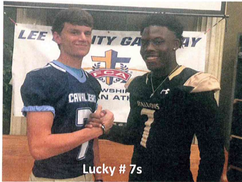
Lucky # 7s

There are always lots of smiles at the Lee County GameDay. When the public school Lee Central Stallions have a pregame meal with the private school Lee Academy Cavaliers , the players experience something that doesn't happen enough. The two schools are only about 5 miles apart but the students don't interact often. Their cultures may be different, yet they have more in common than they realize.