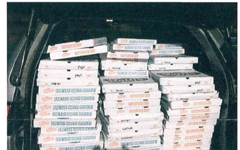
The next morning my car smells great!

We will really need much prayer this week. Thanks so very much for lifting us up! This will be a faith stretching week! What a privilege to trust Him with all the details!