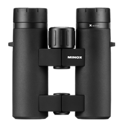
X-active 8x33 | 10x33