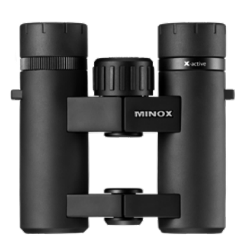
X-active 8x25 | 10x25

With just one glance, you're right in the middle of the action: The MINOX X-active binocular series brings you closer to the game in your hunting grounds - thanks to 8x or 10x magnification and up to 140 m field of view. These all-round talents offer you very good optical performance with neutral color rendition and high contrast, even in the last fading light or at dawn. The Comfort Bridge provides a convenient operation and safe identification of game, even with one hand - an invaluable advantage when stalking, inspecting your hunting grounds or while sitting in your hide. Discover your new all-round binoculars for hunting now - with a 30-year warranty (after registering your binoculars at minox.com).