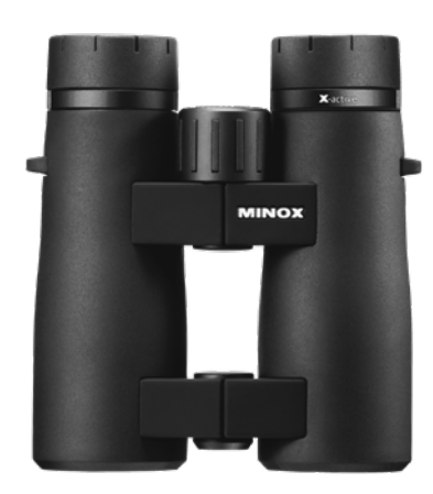
X-active 8x44 | 10x44