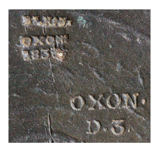
\P This one-pound bronze weight is a remarkable survival from the 16th century and has a crowned h (Henry VII/VIII) stamped on the front. The marks shown here were stamped on the reverse in the 19th century: three variants of the Oxfordshire, District No 3 mark.