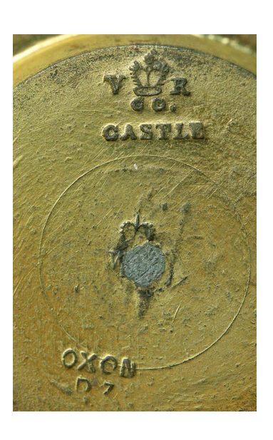
¶ Details from the 1lb weight above and an (8 oz) brass weight, illustrating two variants of the Castle stamp. The 8 oz weight also has the mark of the City of Oxford and the OXON D7 mark of the Ploughley district of Oxfordshire.