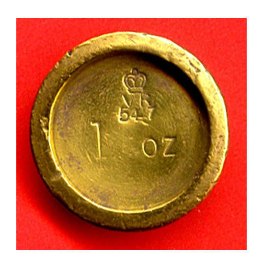
¶ 1oz brass weight stamped in Banbury with the uniform mark adopted by the borough in 1890. The initials VR indicate that it was stamped before 1902. The chief constable of the borough police force was the inspector of weights and measures in this period.