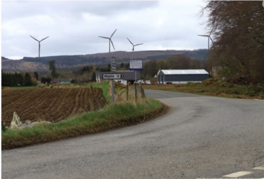
Proposed Turbines from Clatt Aerial perspective - based on information on ECU Project

If you, your neighbour, or animals rely on hill water, you should have received a note from the developer's