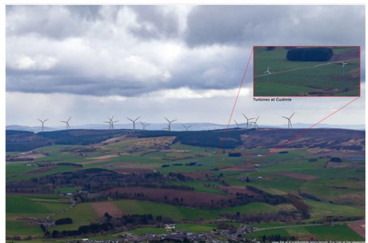
Proposed Turbines from Tap O' Noth Artist Impression - Based on information on ECU Portal

We also commissioned a series of photomontages, 4 of which are below, the rest will be on show at the public meeting. These have all been prepared using approved equipment and software; and are based on the locations on the ECU website. They show the visual impact of the turbines from a variety of locations around the vicinity of the development.