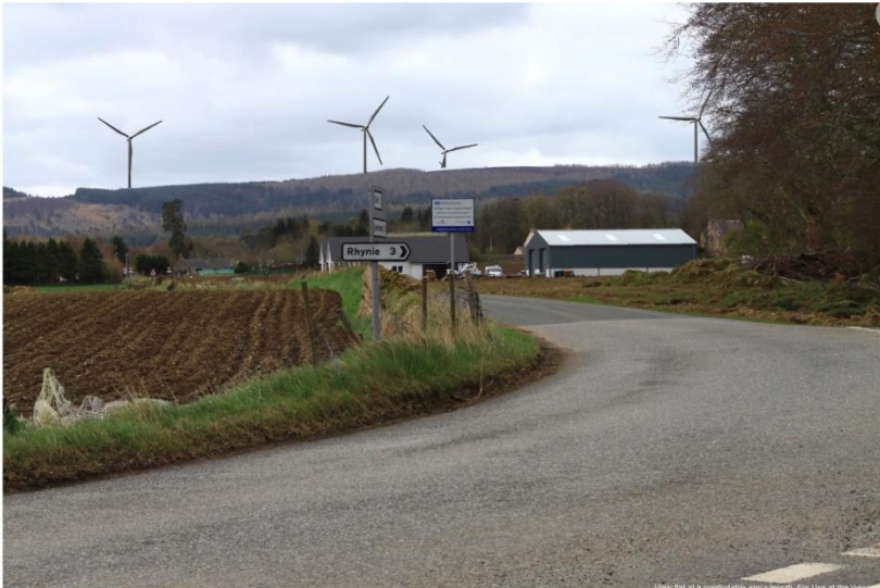
Proposed Turbines from Clatt Artist Impression - Based on information on ECU Portal

at Glendye, HoF (if approved), Clashindarroch, and Craigwatch (if approved). They also feel that 50+ days of traffic disruption is not “significant”. Force 9 Energy / EDF are hoping to hold “community consultation” session prior to the start of school summer holidays. We have not heard when and where these sessions will be held.