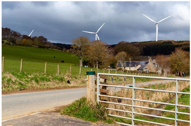
Proposed Turbines from Bogieshalloch Artist Impression - Based on information on ECU Portal

Cavendish Consulting (representing Force 9 Energy), have confirmed by email that they told Bennachie Community Council that the proposal will now have 10 turbines (down from 14) and two of these will be reduced in height to 180m.