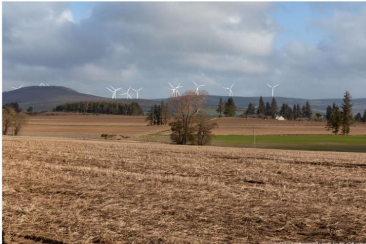
Proposed Turbines from outskirts of Alford Artist Impression - Based on information on ECU Portal

Planning experts have advised us that the windfarm development proposed at Hill of Fare (HoF), will be good indicator of the likely works required of the Correen Hill development. The HoF application was made in October 2023 and is still in the process of review by the developers as well as the Scottish Government. We're keeping our eyes peeled!