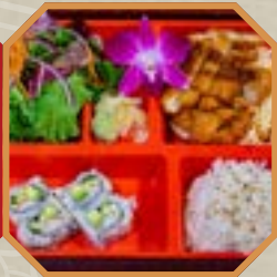
CHICKEN KATSU BENTO