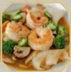
SHRIMP LARD NA NOODLES