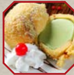
GREEN TEA TEMPURA ICE CREAM