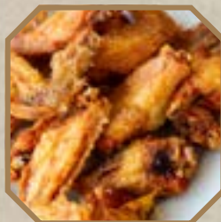
FRIED CHICKEN WINGS