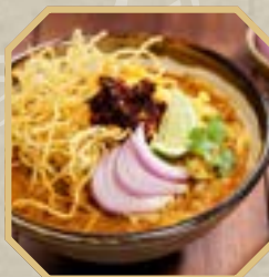
CURRY NOODLE SOUP KHAOSOI