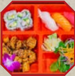
CHICKEN TERIYAKI BENTO