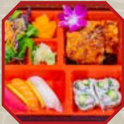
SALMON TERIYAKI BENTO