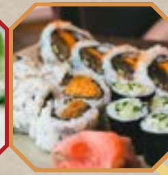
SWEET POTATO ROLLS