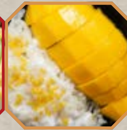
MANGO STICKY RICE