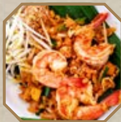
SHRIMP PAD THAI

*Our Flat rice noodles contain wheat flour as an ingredient so that they may contain gluten.