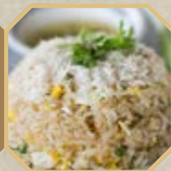
BLUE CRAB FRIED RICE