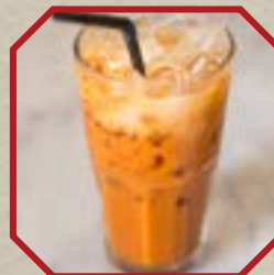
THAI ICE TEA