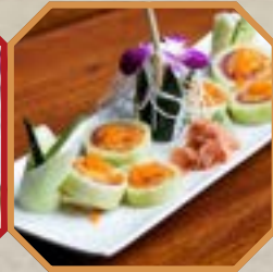
COOL SUMMER ROLL