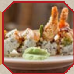
SHRIMP TEMPURA ROLL