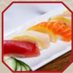
SUSHI CHEF CHOICE