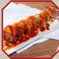
HOLIDAY SPECIAL ROLL