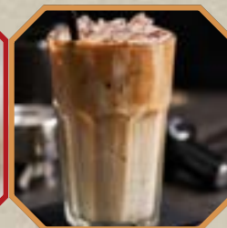
THAI ICE COFFEE