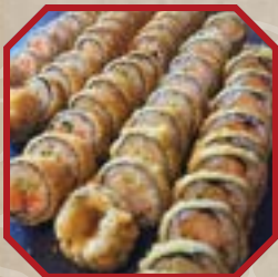
DEEP FRIED ROLLS