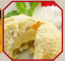
VANILLA TEMPURA ICE CREAM