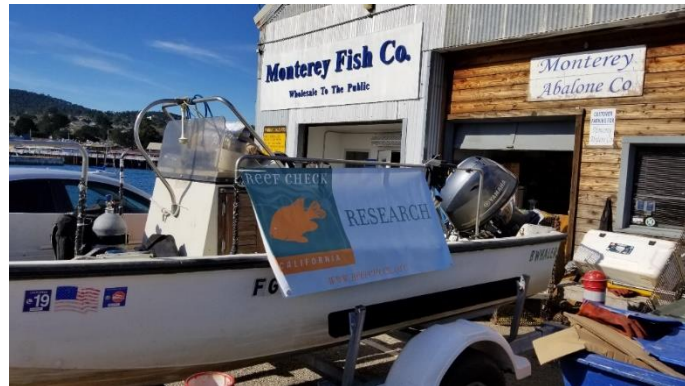
Figure 7: Monterey Abalone Company, Municipal Wharf #2, Monterey California - Photo: Keith Rootsart

The Monterey Abalone Company has been farming red abalone on the commercial wharf for over 30 years, but with the lack of kelp in Monterey, they are unable to harvest enough kelp locally to feed and grow the abs hanging in cages below the wharf (Seavy, 2019). A plentiful and mature kelp forest adjacent to the wharf would be beneficial to their farmed abalone business and ensure that the abalone delicacy is still available to consumers especially since the abalone fishery on the north coast is closed until 2021 and the SoCal green abalone population recovery is just beginning while the demand for abalone is increasing.