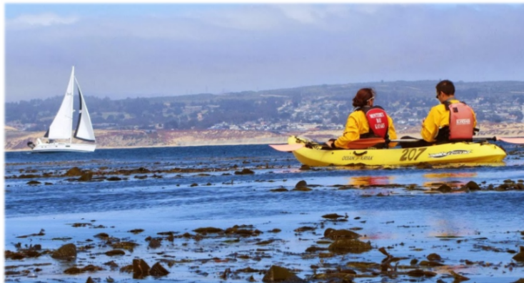
Figure 6:

The Monterey County Convention and Visitor's Bureau regularly conducts surveys of hotel guests and tourists and the number one reason people come to Monterey county is "Scenic Beauty" (Monterey County Convention and Visitors Bureau, 2017). Tourism in Monterey County injected $2.85 billion into the local economy in 2018 . The adverse economic impact due to lack of kelp forests, collapse of the