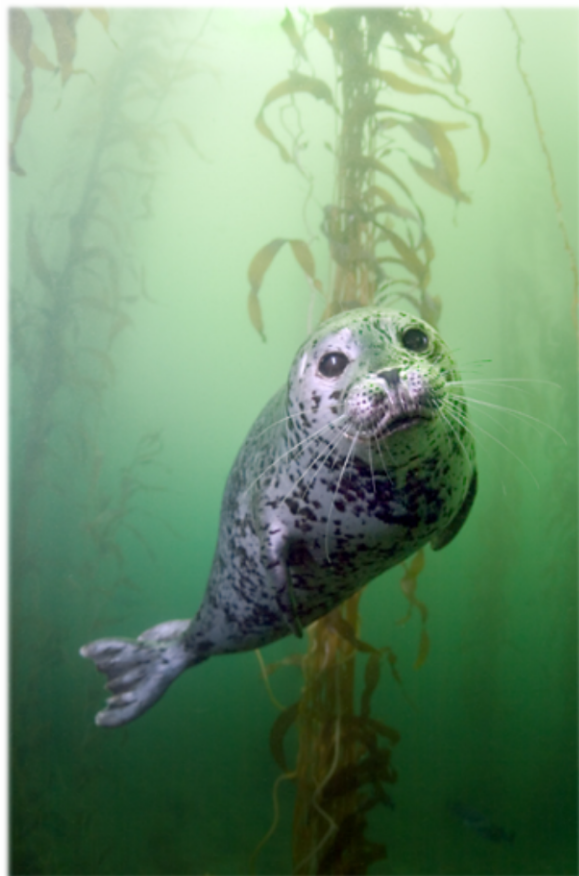
Figure 3: "Tanker Reef" September 24, 2005

Tanker's Reef has excellent characteristics making it an ideal candidate for removal efforts. The site is just offshore from a long wide sandy beach, parking is available within easy walking distance and there are not nearshore tidepools or protected areas that might be disturbed or trampled by increased use. It is immediately adjacent to the Monterey Municipal Marina and is at the south end of the bay that is normally in the wave shadow of Point Pinos and also behind the San Carlos Breakwater jetty. This area is diveable in all but the most severe conditions from boat or from shore, normally 50 weeks out of the