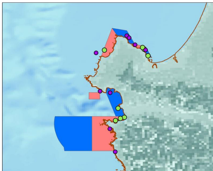
Figure 1: Reef Check California 2018 Monterey Survey Sites. Purple indicates urchin barrens and green indicates non-urchin barrens. Blue areas are MPA Reserves and orange areas are MPA Conservation Areas

A combination of unprecedented environmental and biological stressors has caused the giant kelp ( Macrocystis pyrifera ) forest, an important habitat for young of the year rockfish, to collapse . Today, the once abundant kelp is severely depleted due to openly grazing purple urchins ( Strongylocentrotus purpuratus ) dominating the nearshore ecosystem. Of the 16 sites that Reef Check California (RCCA)