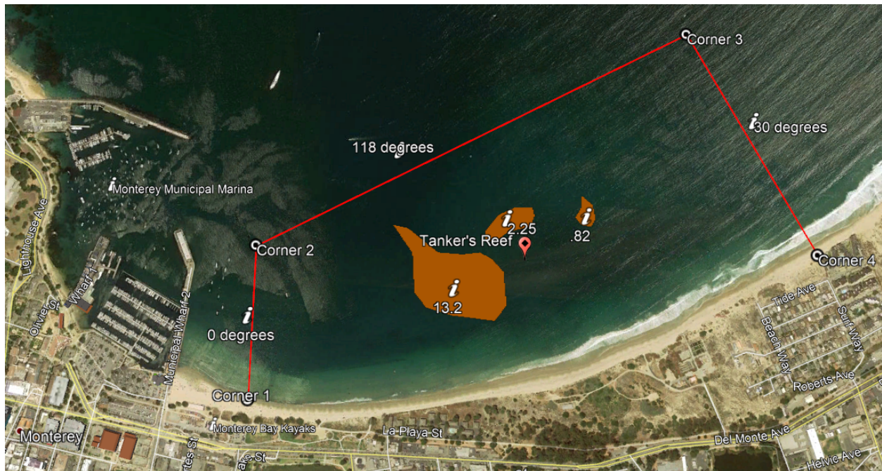
Figure 5: Area of Emergency Regulation Change. Coordinates available as Tanker's Reef.kmz

An area encompassing approximately .33 square nautical miles or 283 acres.