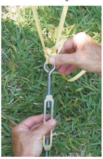
Fig 8 Fig 9 See www.HurricaneScreenSaver.com for installation videos