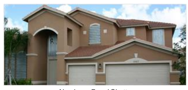
Aluminum Panel Shutters