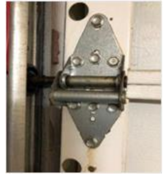
Track and Roller