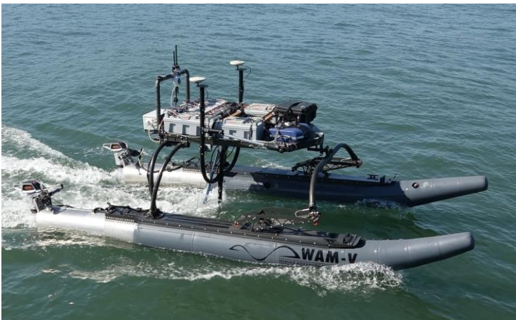
WAM-V 16 ASV with multi-beam sonar system

4 battery config, 250 lbs (113 kg) 6 battery config, 150 lbs (68 kg)