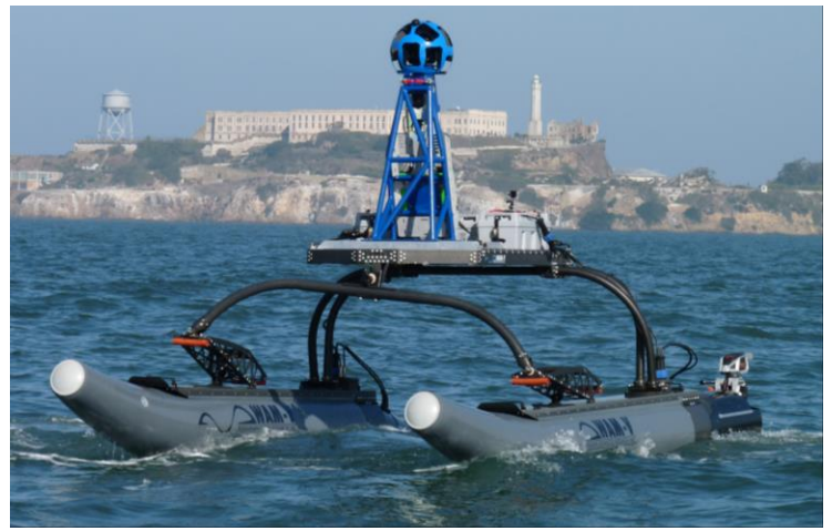
WAM-V 16 ASV with Google Trekker Camera System

PC, tablet, and mobile front-end Graphical User Interface (GUI) with multimodal network software and firmware governing ROBO-HELM parameter inputs for communication, navigation, velocity, steering, and secure auxiliary sensor data transmission.