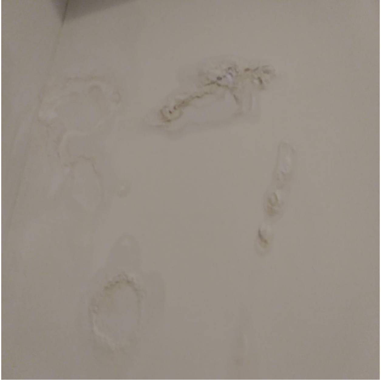
Water Damage Bedroom-May 31, 2022 Pic 3