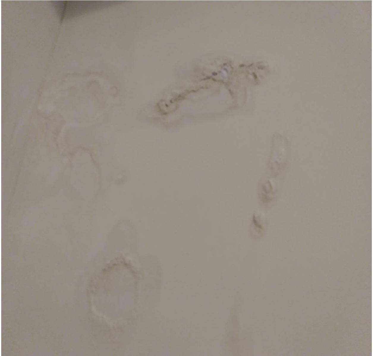
Water Damage Bedroom-May 31, 2022 Pic 2

May 30, 2022-June 3, 2022-I returned to my Riv