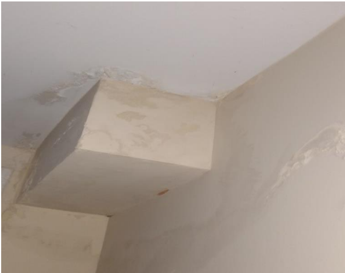
Water Damage to Living Room, May 2021-September 28, 2021-Picture 1

I cannot complete this task due to extensive water damages in my condo. See pictures, work order and repair schedule mass email