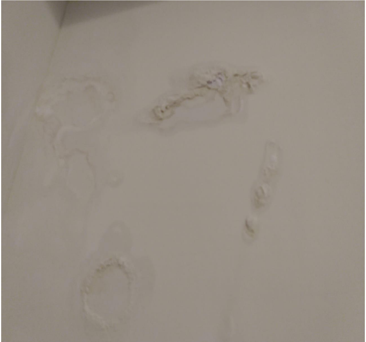
Water Damage Bedroom-May 31, 2022 Pic 5