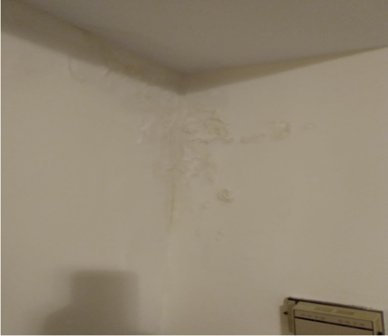
Water Damage to Bedroom Room, May 2021-September 28, 2021-Picture 1