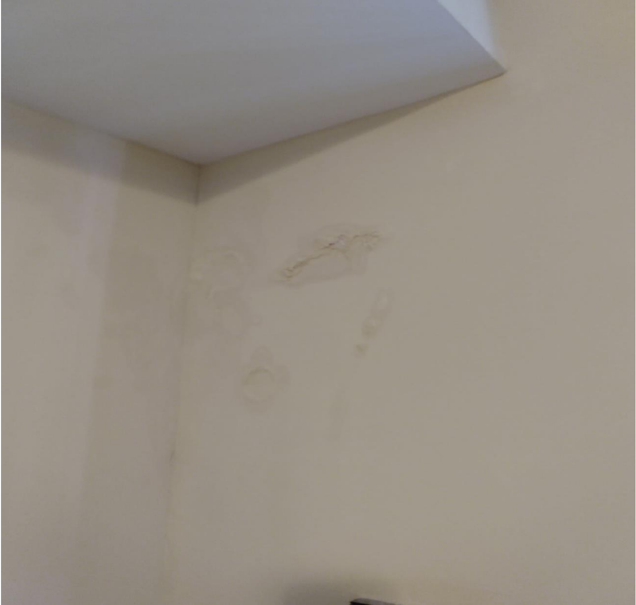
Water Damage Bedroom-May 31, 2022 Pic 4