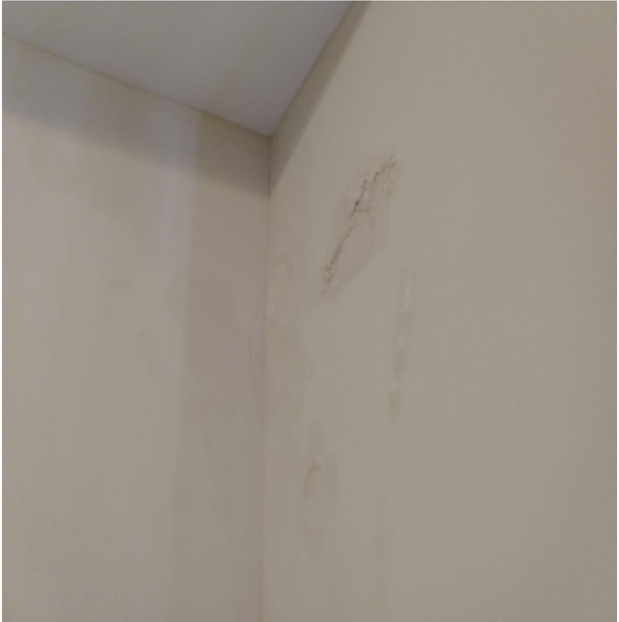
Water Damage Bedroom-May 31, 2022 Pic 1