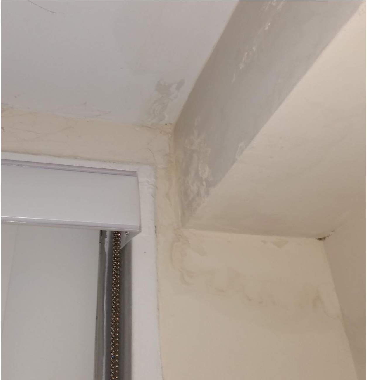
Water Damage to Living Room, May 2021-September 28, 2021-Picture 2