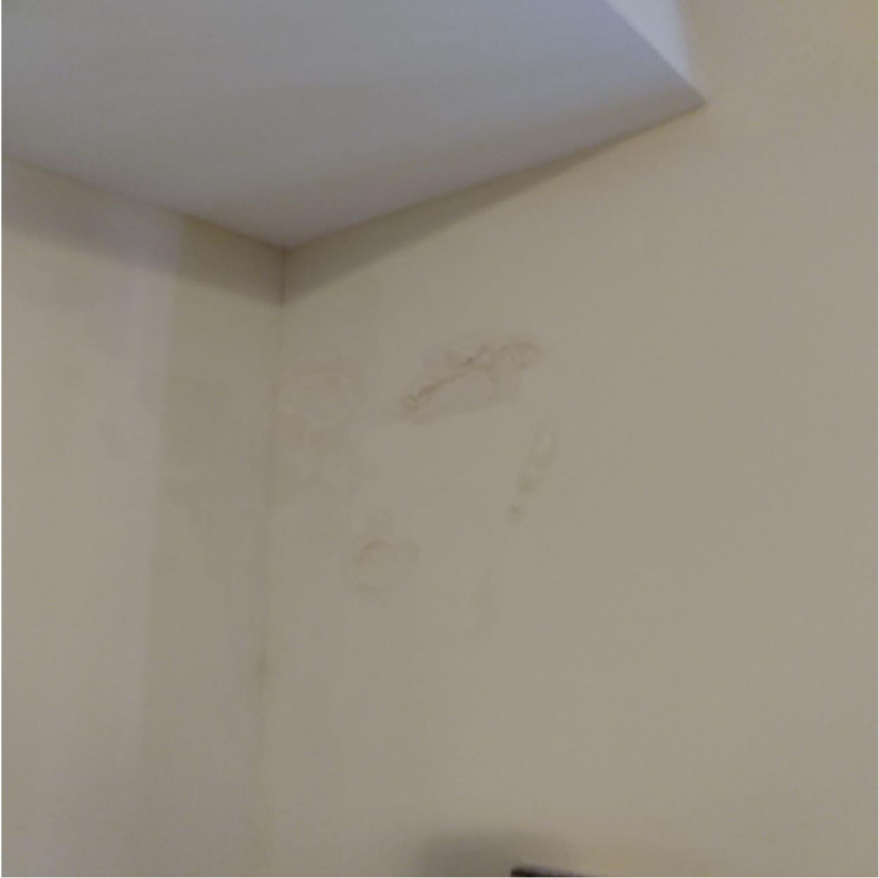
Water Damage Bedroom-May 31, 2022 Pic 4