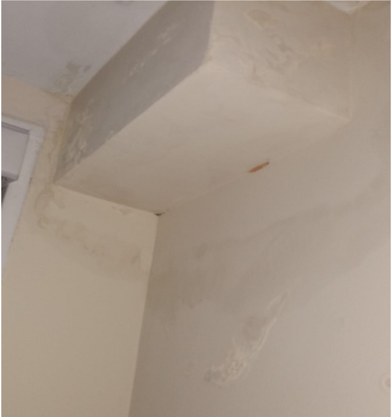
Water Damage to Living Room, May 2021-September 28, 2021-Picture 3