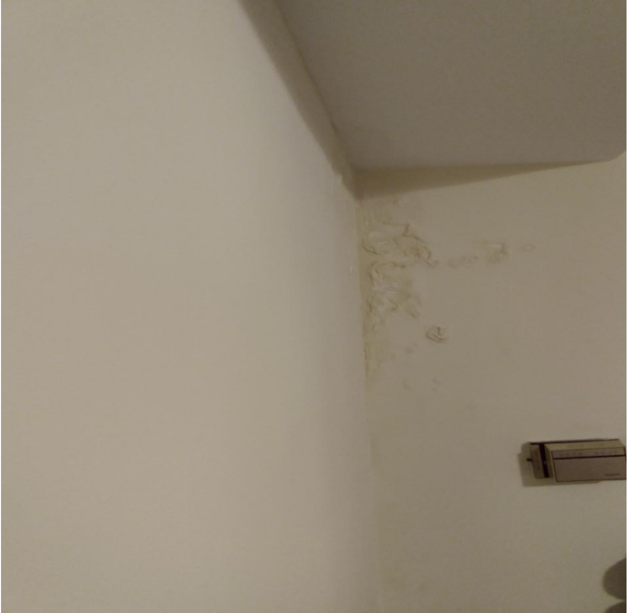
Water Damage to Living Room, May 2021-September 28, 2021-Picture 2