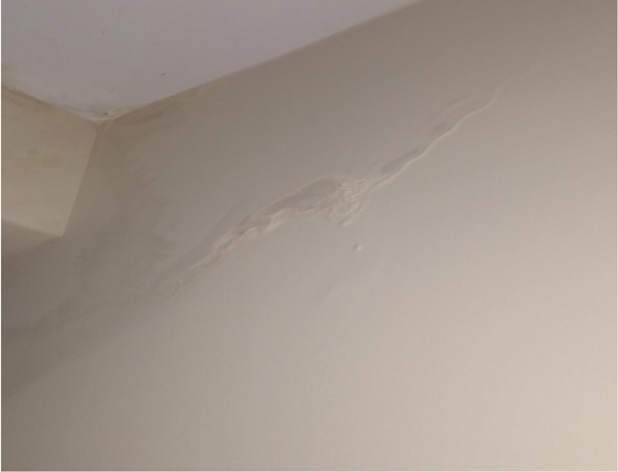
Water Damage to Living Room, May 2021-September 28, 2021-Picture 2