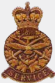
Gold 32 Year

Have you been ill or injured from your service?