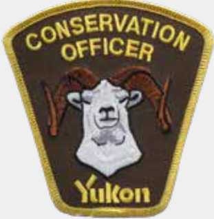
75th Anniversary Yukon Conservation Officer Services 1949 - 2024