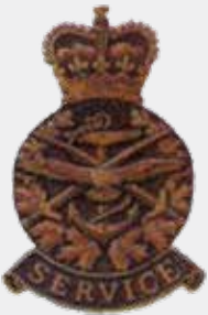
Bronze 12 Year