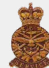
Gold 32 Year

Are you missing a Service Pin or your Certificate of Service (CF 54)?