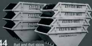
8yd and 6yd skips

We pride ourselves on having services to suit everyone's requirements. Please give our friendly trained operatives a call for professional assistance today!