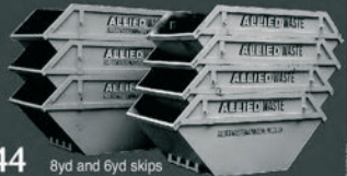
8yd and 6yd skips

We pride ourselves on having services to suit everyone's requirements. Please give our friendly trained operatives a call for professional assistance today!