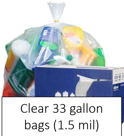
Clear 33 gallon bags (1.5 mil)