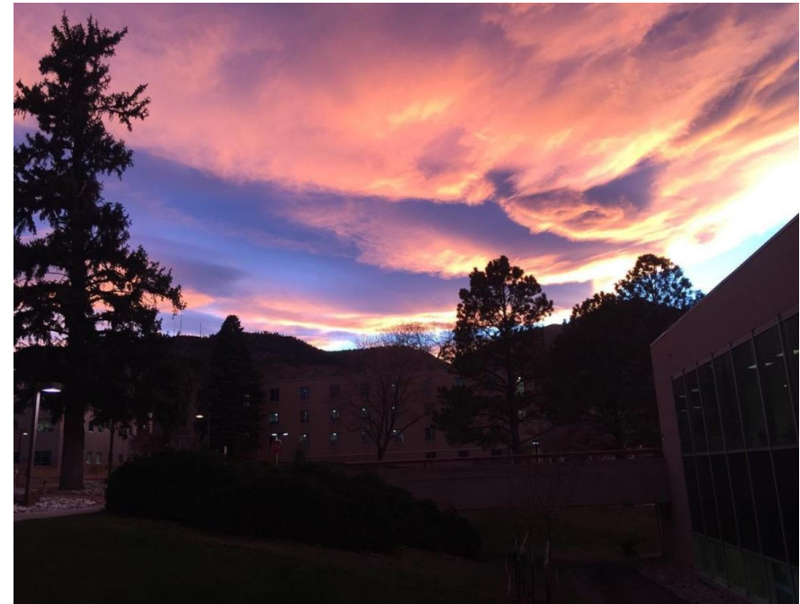
The view outside of the library I frequently studied at in Colorado. =)