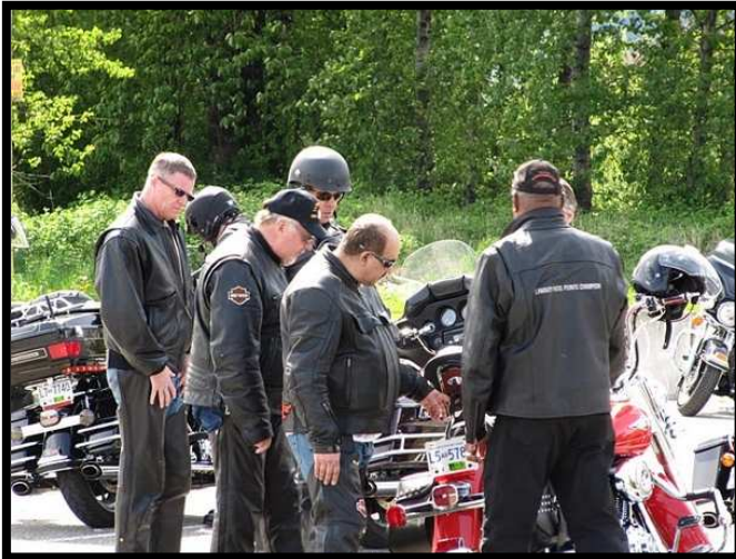
My Hog buddies checking out my new ride, a 2010 Heritage Softail

even joined the over night ride to the Oyster run. I was blown away with the number people and bikes.