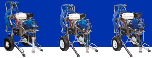
GMAX II (HD 3-IN-1) ProContractor