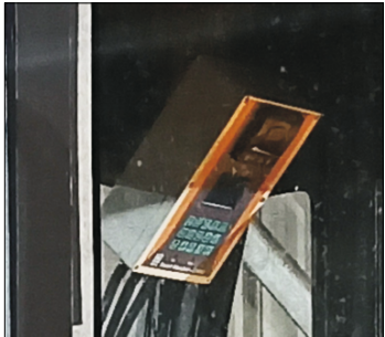
Electronic batch controller