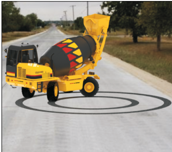
Short turning radius