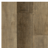
4002 Copper Ridge