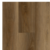
4004 Rio Grande