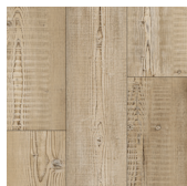
4001 Broughton Street