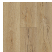
4005 Sunset Cruise