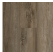
4003 Park Place