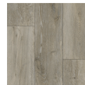
4006 Victoria Falls