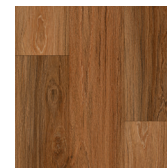
4007 Sao Paulo